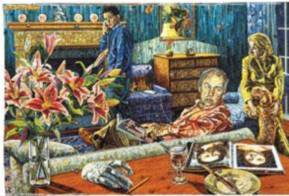
"The Next Generation: Contemporary Expressions of Faith" is a catalog of an exhibit at the Museum of Biblical Art. "Allegory of the Senses," 2002, by Mary Fielding McCleary. Courtesy photo

On that note, I'm pleased to divert your attention from the boob tube and toward the catalog of a juried art exhibit titled "The Next Generation: Contemporary Expressions of Faith" is a catalog of an exhibit at the Museum of Biblical Art. "Allegory of the Senses," 2002, by Mary Fielding McCleary. Courtesy photo